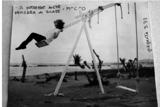
“You can even think of flying.” MACAO, a skyscraper squatted between 5 and 15 May 2012 in the very center of Milano.

The cultural turn of the Occupy movement: understanding the commons as a means for emancipation